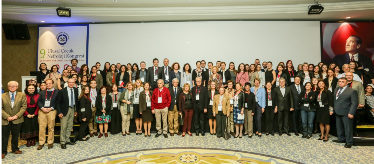
From the 9th Congress of Turkish Society of Pediatric Nephrology

First National Congress of TSPN was held in 1996 and thereafter repeated every two years. World experts from Europe and North America have been invited to our national meetings and a number of Turkish nephrologists had given many talks during international meetings, which promotes the exchange of knowledge and provides a mutual benefit to the societies.